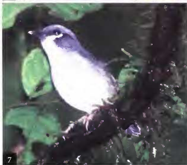
Figure 3. White-striped Forest-Rail Rallidula leucospila , Kumawa Mountains, New Guinea, March 2013